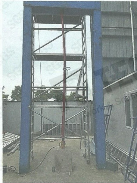
Sample 2 after test