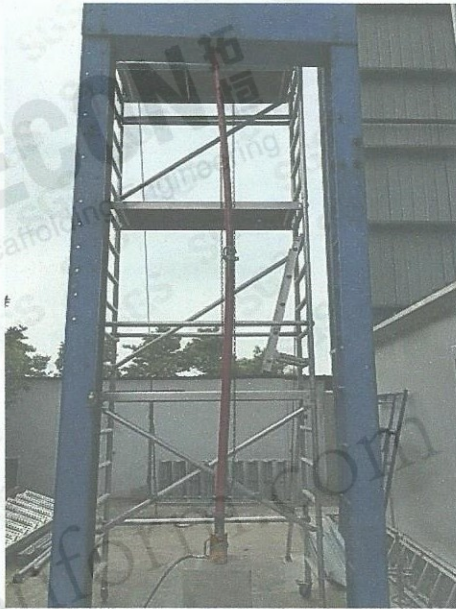
Sample 1 after test