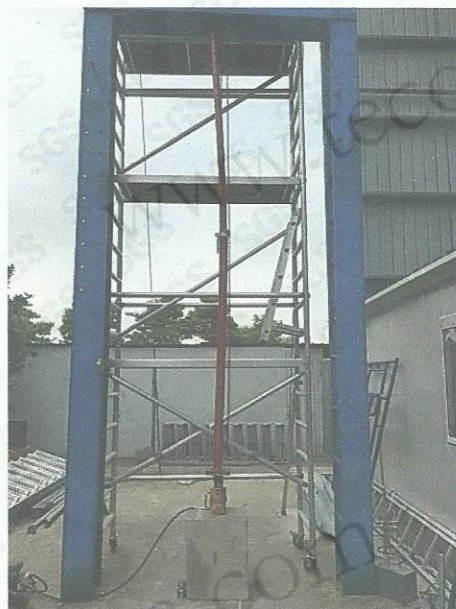
Sample 3 after test